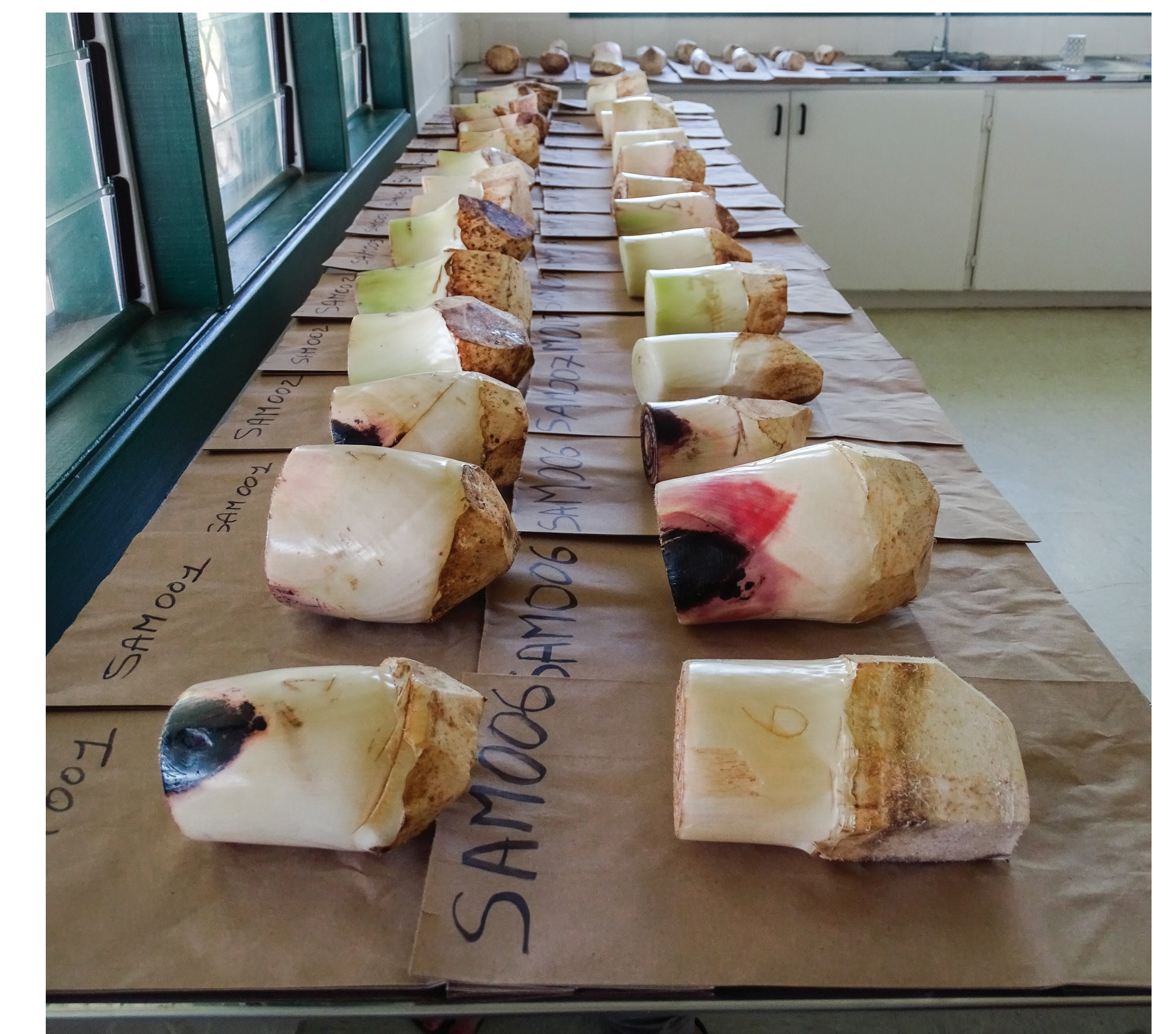
Drying suckers in Samoa ready for shipping to the genebank.

6 31% of the 85 cultivated end-groups are not represented in the ITC collection. Molecular studies suggest that several subgroups, such as Plantain, East African Highland Bananas (Mutika/Lujugira) and Gros Michel, are highly homogeneous. Given that, what is the minimum number of accessions, for each subgroup, that should be conserved ex situ to have a good representation of their genetic diversity?